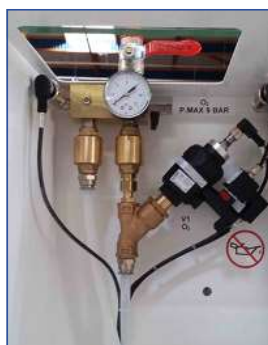
O 2 or air network