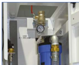
Medical vacuum connection