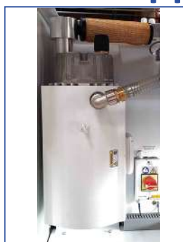
ARICA 41V vacuum pump