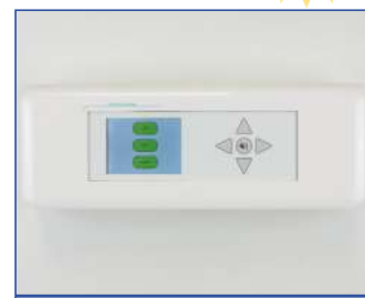
MAVO 3 REPORT (225 x 83 x 47)