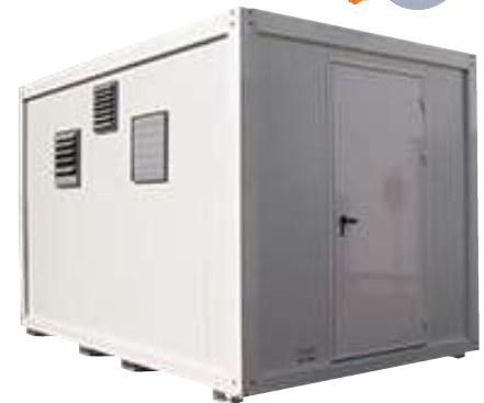
Cabin made of composites panels